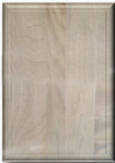
SILVER FOX 17415