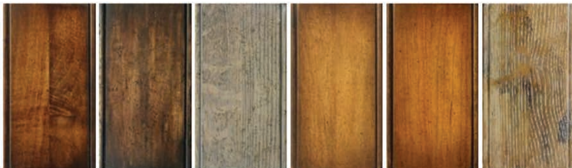
Registry Hanover Bay View Toffee Cambridge 7 Oats