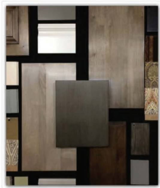
CONCEPT INSPIRATION BOARD

SILVER FOX, 17415 is originally developed on soft maple with a light, shimmery gray undertone that accentuates the subtle color and grain variations present in the wood. The finish is designed with clarity and depth and a semi-gloss patina. Silver Fox compliments a variety of wood tone and paint finishes including Vista, a new Lifestyle Expression Introduction; Bogart from the Lifestyle Expression Collection; Briar from our